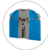
Light and sturdy: Blade guard