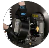
Tool-free motor fastening