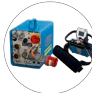
Compact and light control unit, handy remote control with display

The WSE1621 was developed for universal usage and the daily use on the construction site. Thanks to the digital features and the compact and light design, this newly developed system is setting new standards in wall sawing. Assembly