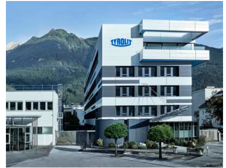
Tyrolit headquarters in Schwaz (Austria)

The family-owned company based in Schwaz, Austria, combines the dynamic strengths of the Swarovski Group with over a hundred years of commercial and technological experience.