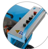
Clear, user-friendly control panel