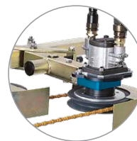
Standard hydraulic drive motor